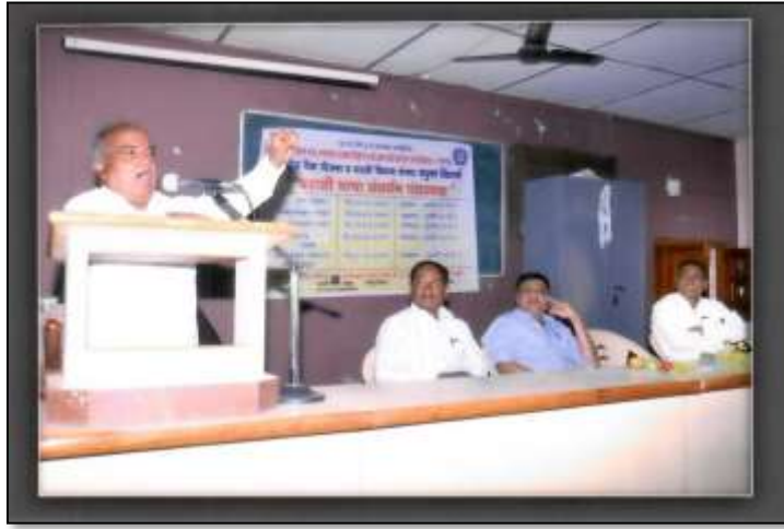
Poet Atmaram Kute Dt.08/09/2019