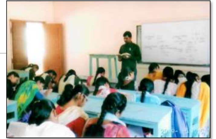
Chalk and Talk Method