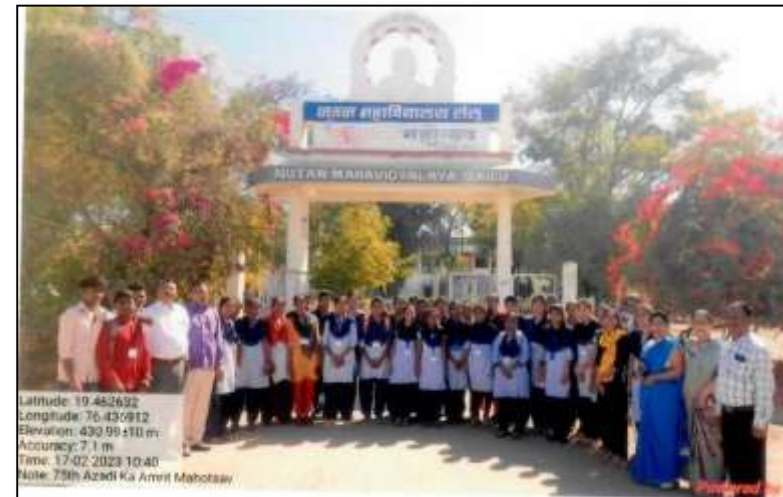
Visit Language Lab